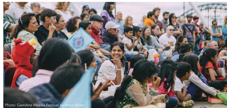
Photo: GemArts Masala Festival

Help us make a difference by supporting GemArts work creating engaging opportunities that benefit individuals and local communities. Thanks to Arts Council England we can currently match every £1 donated, so your support will go even further.