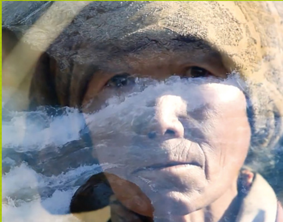
Image: Isaac McCordle Hearing in the Bardo Film Still.