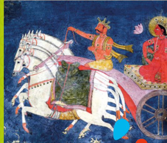
Image: The Sun God Surya on his Chariot